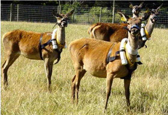
<<<Deer wearing harnesses and halters for methane collection. Hinds were trained to wear this equipment prior to the trial and are reported to have adapted well to it, with grazing behaviour apparently normal.