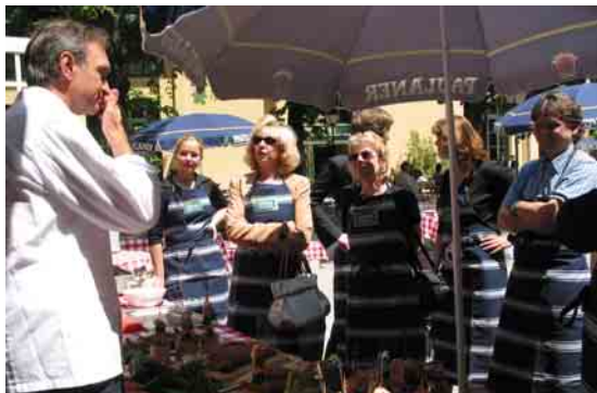
Food media at a Venison BBQ in Munich

As part of "Sommerkampagne" - the New Zealand venison retail campaign stretching from May through to August, German media were given New Zealand venison cooking lessons last week in Munich and Hamburg. A total of 48 journalists and editors attended the demonstrations, where top local chefs gave a BBQ demonstration and some cooking tips.