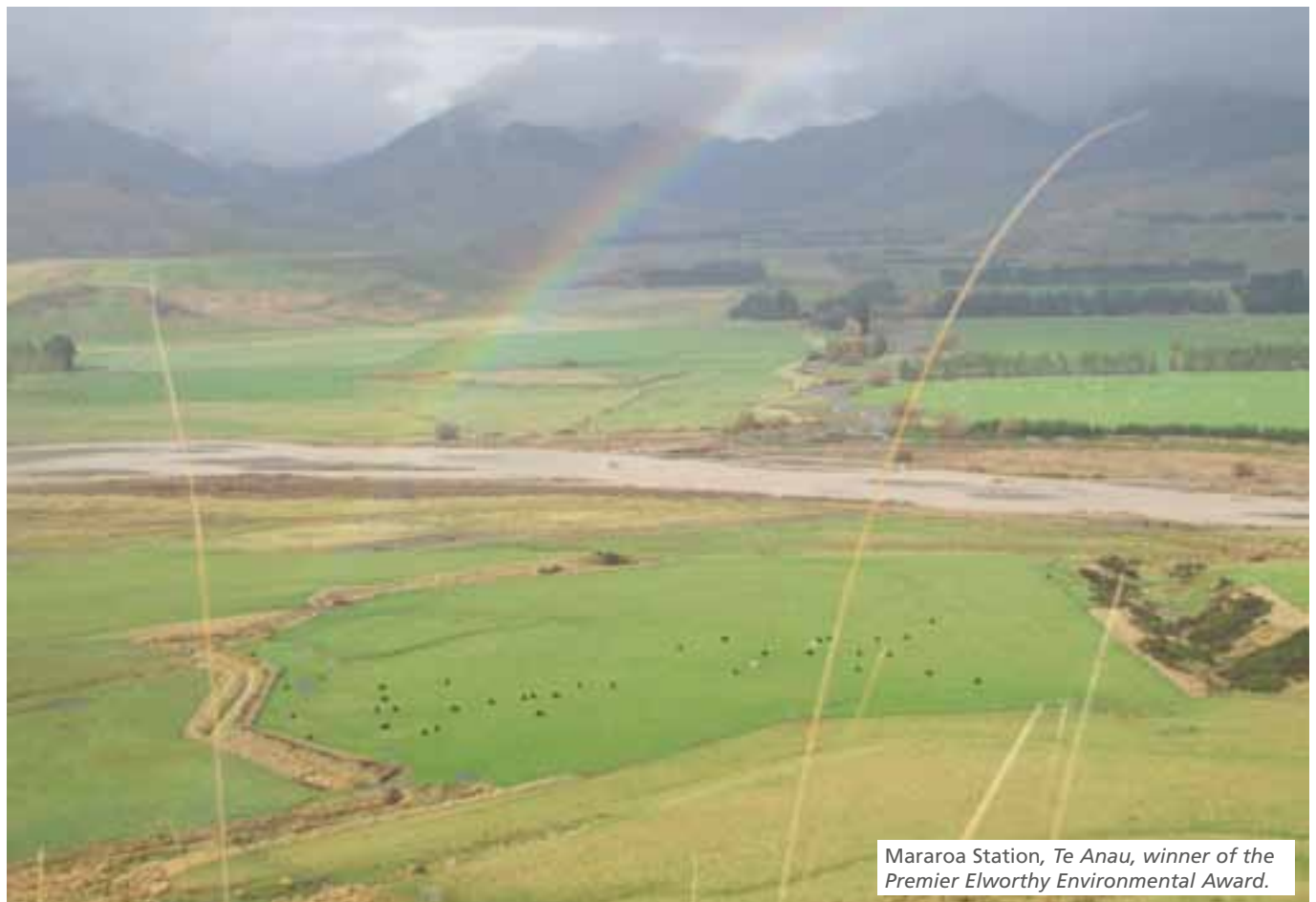
Mararoa Station, Te Anau, winner of the Premier Elworthy Environmental Award.