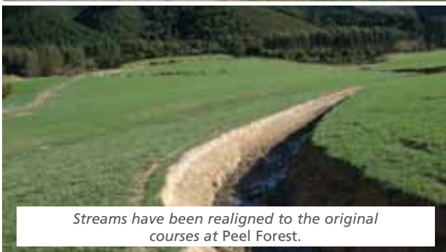
Streams have been realigned to the original courses at Peel Forest.