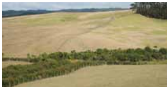
Multi-purpose plantings will provide shelter, runoff protection, wildlife corridors and also eventually community access as walkways through a working deer farm.