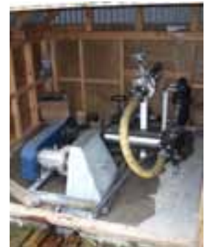
This Pelton wheel pumps 200,000 litres of stock water per day up 180 metres and saves $14,000 per year in electricity costs.

Retention of the tussock grasslands is critical in an environment of thin poor soils and extremes of weather,