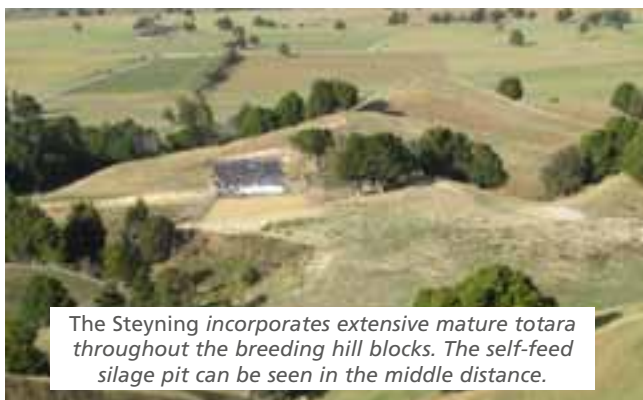
The Steyning incorporates extensive mature totara throughout the breeding hill blocks. The self-feed silage pit can be seen in the middle distance.

The management attitude is one of constant analysis,