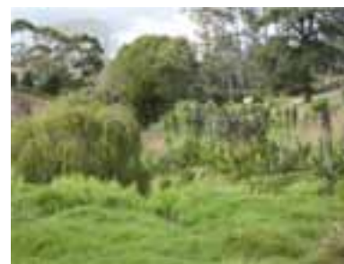
The riparian planting programme uses a mix of native wetland plants.