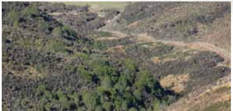
One of the gullies that has been fenced off and is reverting to native vegetation.

Mararoa Station exhibits best practice for production and environmental systems and continues to incorporate new developments and technology.