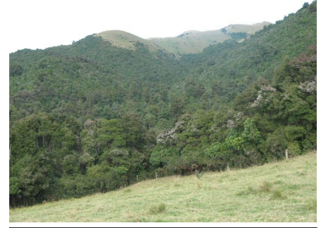
Station Creek area showing extensive areas of podocarp-hardwood forest on Orari Gorge Station

Protection of the significant native forest areas has been a long and gradual process with the original ~75 hectares fenced off from stock by Robert's great, great, grandfather, Charles Tripp in the early 1860's. He placed a bounty of 100 pounds on anyone entering without strict permission. A large area of bush around the homestead was fenced off at the same time. The main area