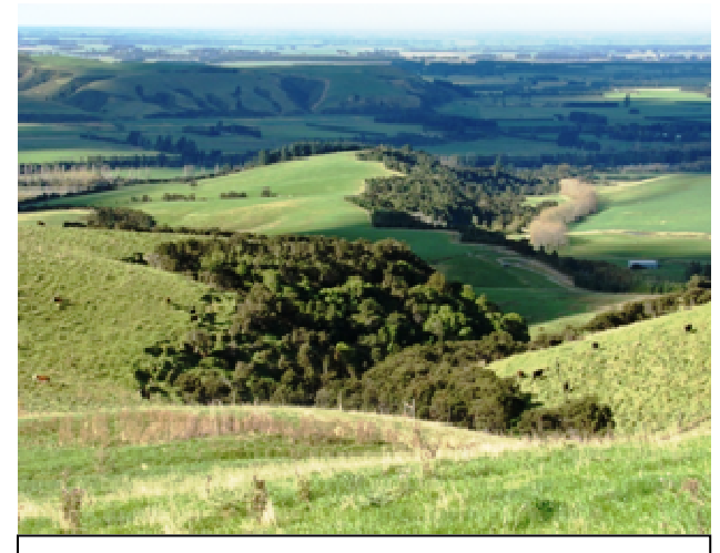
Developed downloads provide high quality feed for finishing weaners and lambs while forested gullies provide natural shelter and protect water quality

The pride that the Peacock family have for their land is obvious. This extends also to their staff who are very loyal and passionate about the property. Overall the judges were impressed by the approach the family took to looking after Orari Gorge Station for the next generation emphasising not only its environmental state but also ensuring it is profitable and therefore sustainable for future Peacock family members.