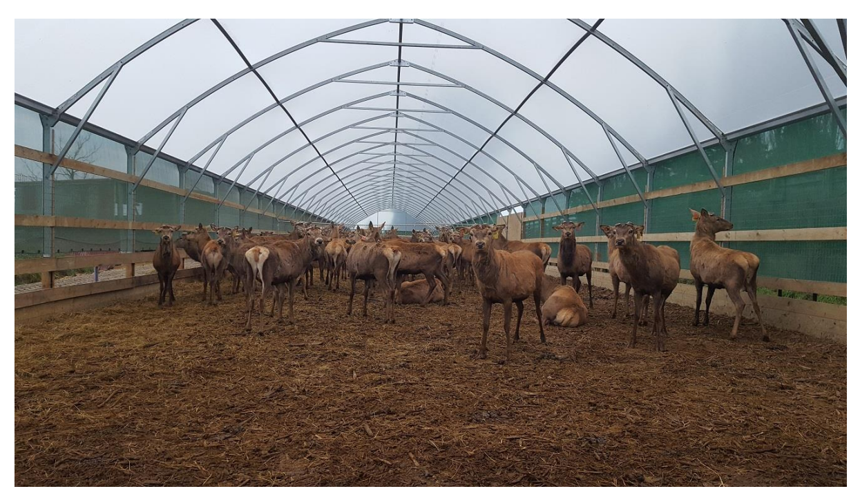
Figure 2. Deer shed bedding spread on ground (left) to be worked post winter.