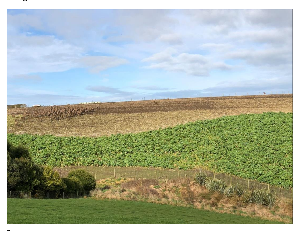
Figure 5\&^6 . Southland winter crop feeding: break fencing, paddock layout and buffer margins. Hinds On Swedes and break fence .