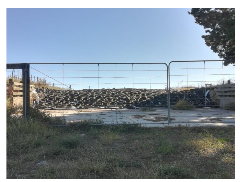
Figure 3 (Courtesy DINZ submission From the Deer industry code of environmental management 2018)

Two examples of deer self-feeding silage pits are shown here: