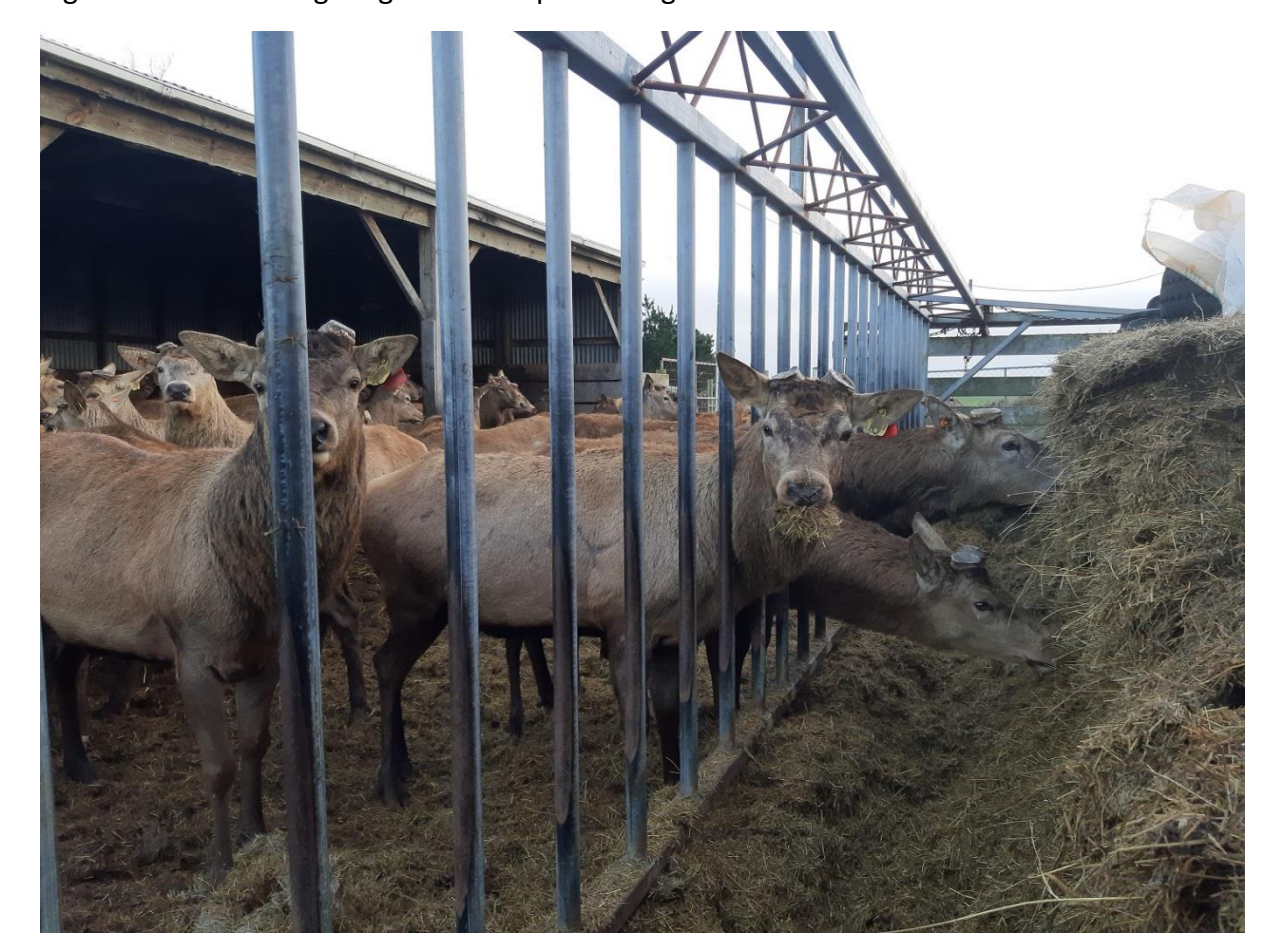
Figure 4 Self feeding silage movable pit feeding control barrier