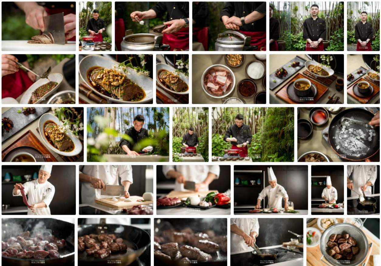
240 images have been captured for companies to use in their marketing activities.

The chef research project has been completed.