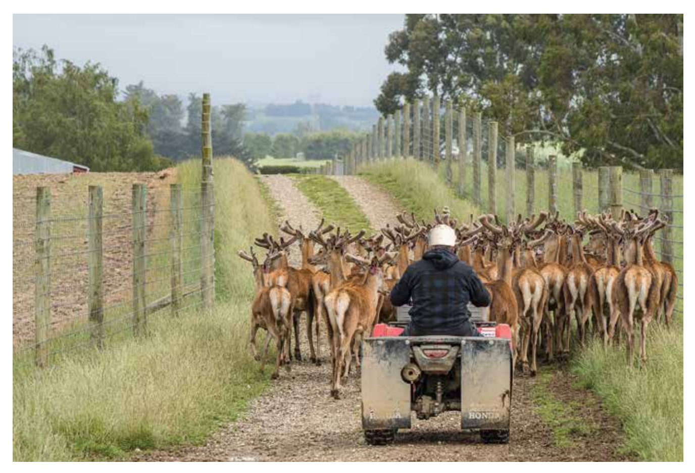
NZ deer velvet is in high demand in Asia for its quality and – equally importantly – for our free range farming systems, and high standards of animal welfare, food hygiene and safety