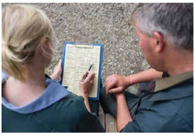
To become certified, you must have a contract with a supervising vet and work closely with them to ensure high standards of animal welfare and velvetting practice