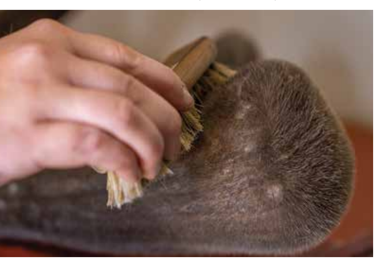
Velvet is a premium health food ingredient. Cleanliness during velvet removal and storage is essential

Before it leaves the farm, it must be tagged with an electronic VelTrak label that enables it to meet MPI traceability requirements for animal-based food products. Velvetting drugs must be stored safely, used correctly and records kept.