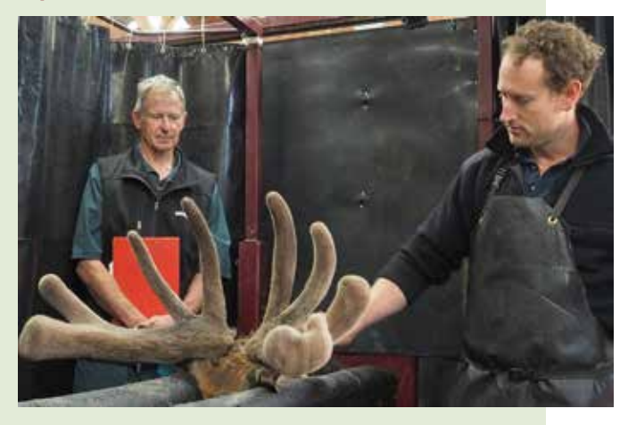
The role of your supervising veterinarian is to make sure you can remove velvet from stags safely, hygienically and with effective pain relief