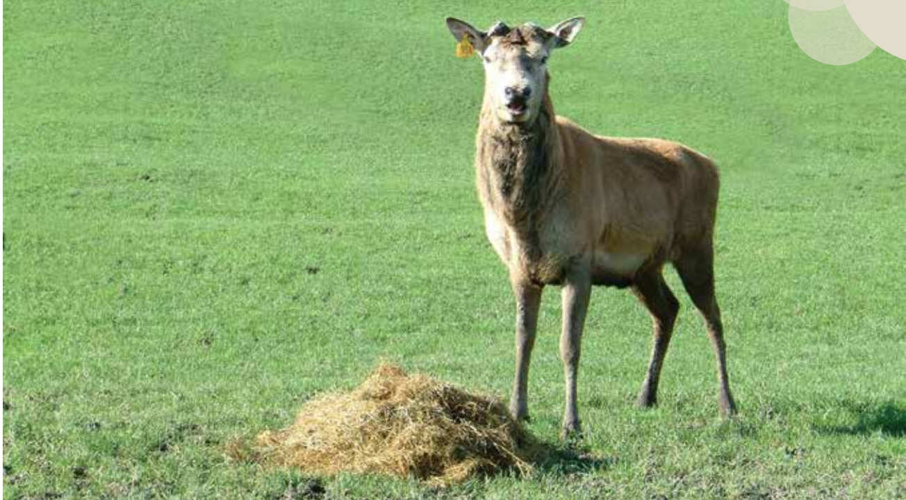
Space out winter feed well to reduce fighting and bossing