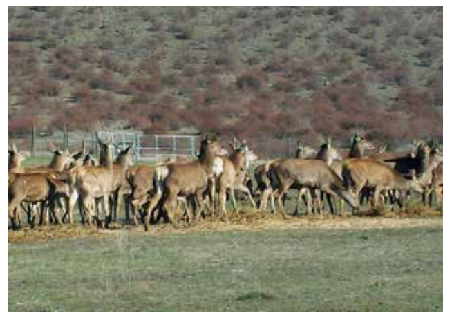
Pregnant or dry? Pregnancy scanning will show a mob's conception rate, identify unproductive hinds that can be sold and can predict the date when a fawn will be born